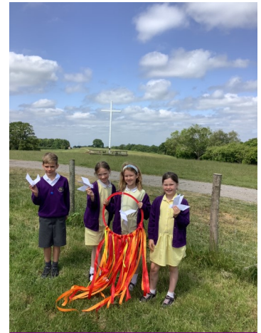
Spiritual Council members at Wintershall

Glory be to the Father, and to the Son, and to the Holy Spirit. As it was in the beginning, is now, and ever shall be, world without end. Amen.