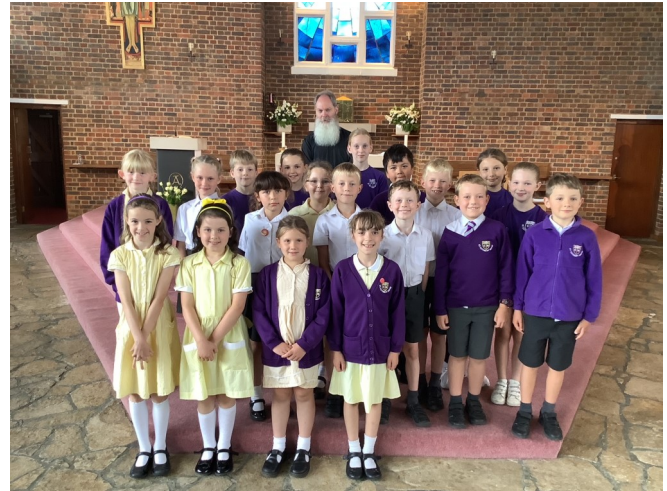
St Cuthbert Mayne Catholic Primary School

Last Sunday was the last of three consecutive weekends of First Holy Communion Masses in Cranleigh and Bramley. We were proud to have children from the school taking the sacrament for the first time at each of the Masses. They received Communion again this Thursday as Key stage 2 children joined the Parish Mass in Cranleigh to mark the feast of St Peter and St Paul. During Celebration Assembly they were presented with a cross pin badge to commemorate this significant step in their faith journey.