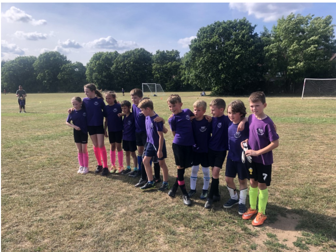
Year 4 Footballers at Tillingbourne